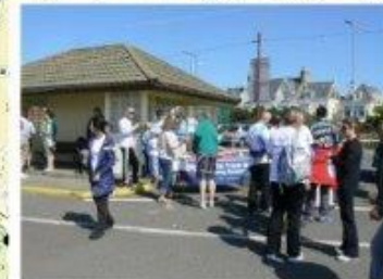
2nd Check Point Bel Royal

3rd Check Point St.Brelade's Church (Monument in front of St.Brelade's Church.)