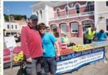
Drinks Station St. Brelade