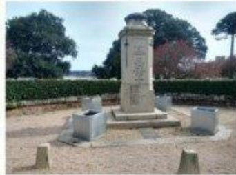
3rd Check Point, monument close to St.Brelade Hotel.

This map is thematic, featuring general information. No loss or damage caused by the use of this product will be accepted.